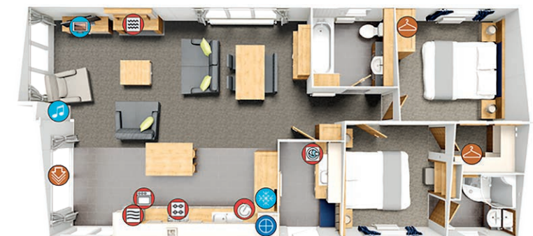
2 bedroom model