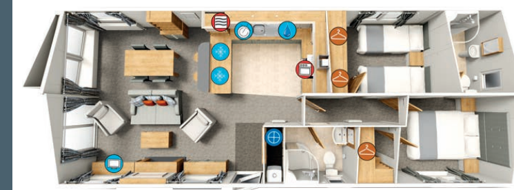
2 bedroom model