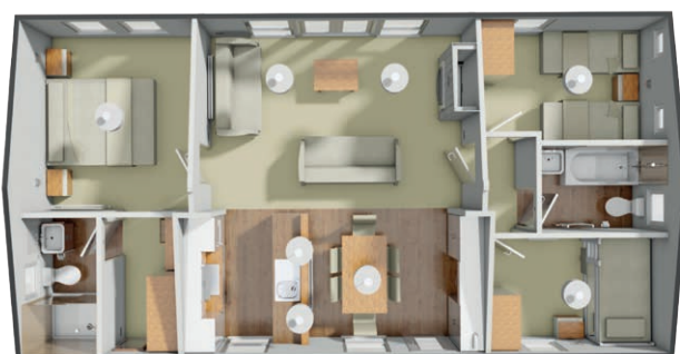
3 bedroom model