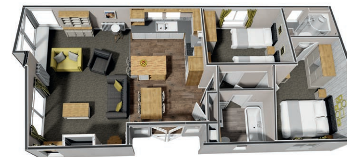
2 bedroom model