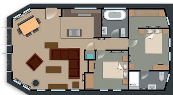
2 bedroom model