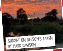
SUNSET ON NELSON'S