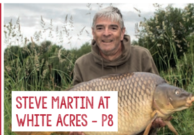
STEVE MARTIN AT WHITE ACRES - P8

Visit whiteacres.co.uk and book direct for our latest deals