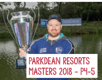
PARKDEAN RESORTS MASTERS 2018 - P4-5